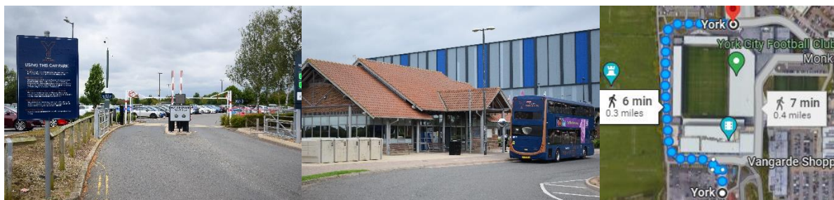
Left: View of the car park

Please select this at the checkout (if buying online) or arrange with the Ticket Office via phone, e-mail, or in person.